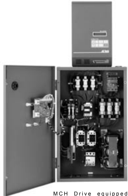
MCH Drive equipped with Bypass, Line Reactor, Disconnect, and Bypass Fuses